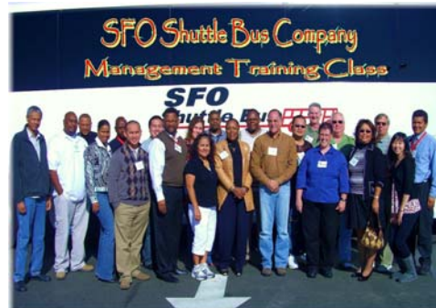
SFO Management Training Program